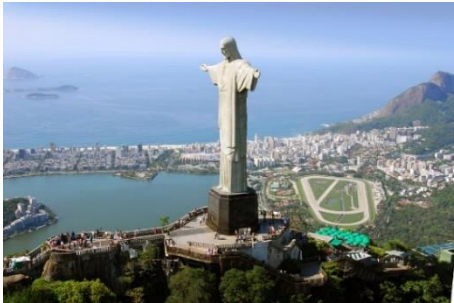
Christ the Redeemer is a statue of Jesus Christ in Rio de Janeiro, Brazil.